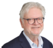
Chairman of the Board Independent Director